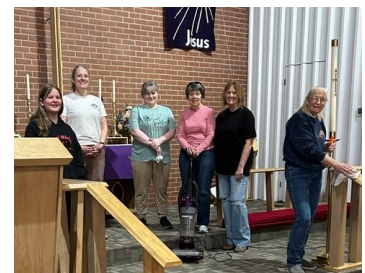
Altar Guild and friends cleaning for Easter.

"God of all grace and mercy, bless those who serve as members of the altar guild that they may be faithful in their service. Grant them steadfast devotion and strong faith. By their loving service to your house of prayer and your altar of worship may your church be built up to the praise and honor of your most holy name; through Jesus Christ, who live and reigns with you and the Holy Spirit, one God, now and forever. Amen"